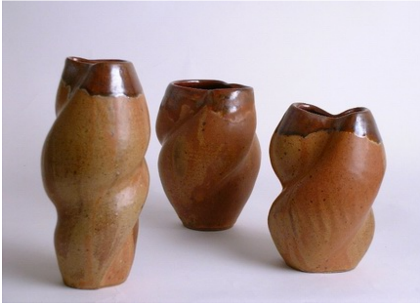
Three ceramic vases by Dahlia Kaufman 8.5"x4", 7"x4", 7"x4.5"